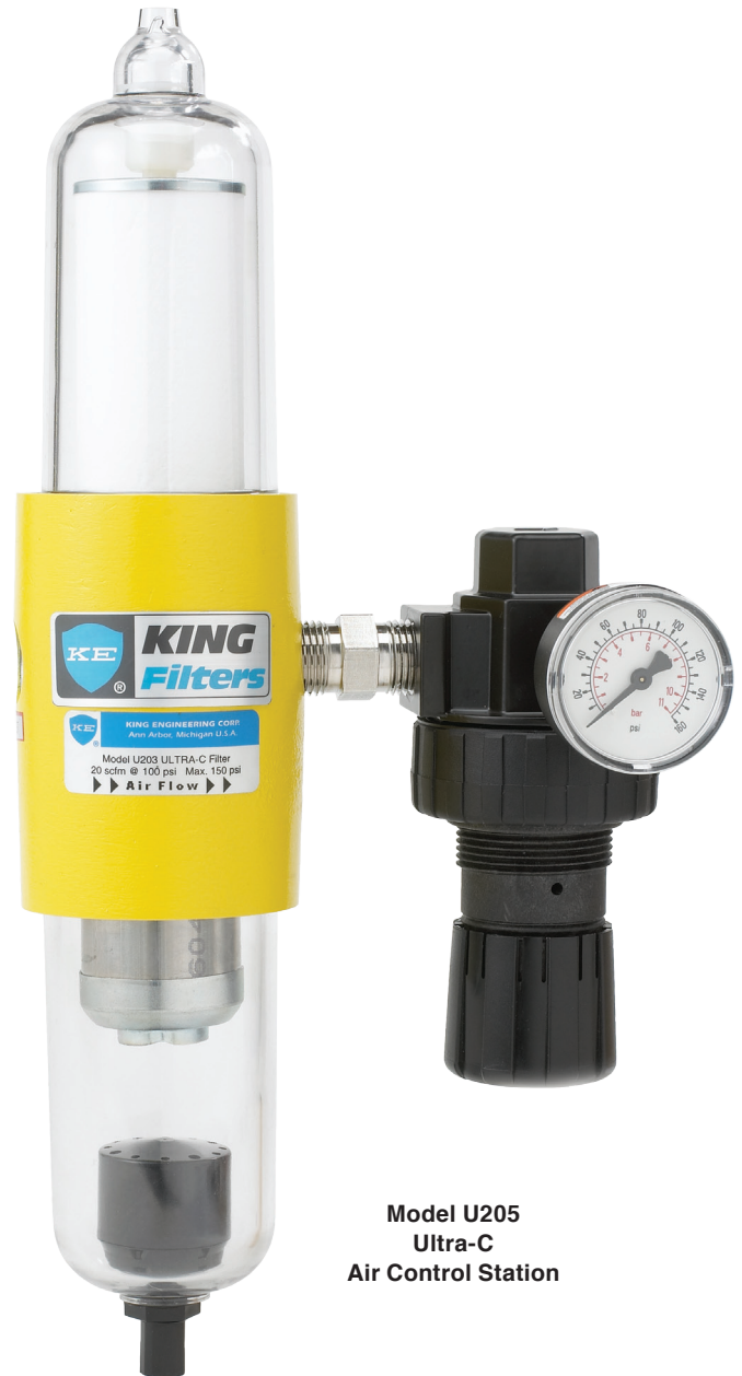
Model U205 Ultra-C Air Control Station

KING U205 Air Control Stations are intended for light duty environments not directly exposed to prolonged direct sunlight. The U205 has an aluminum housing with polycarbonate sumps, while the regulator is supplied with cast zinc body. Inlet and outlet connections are 1/2" NPT designed to accept standard tube or pipe fittings.