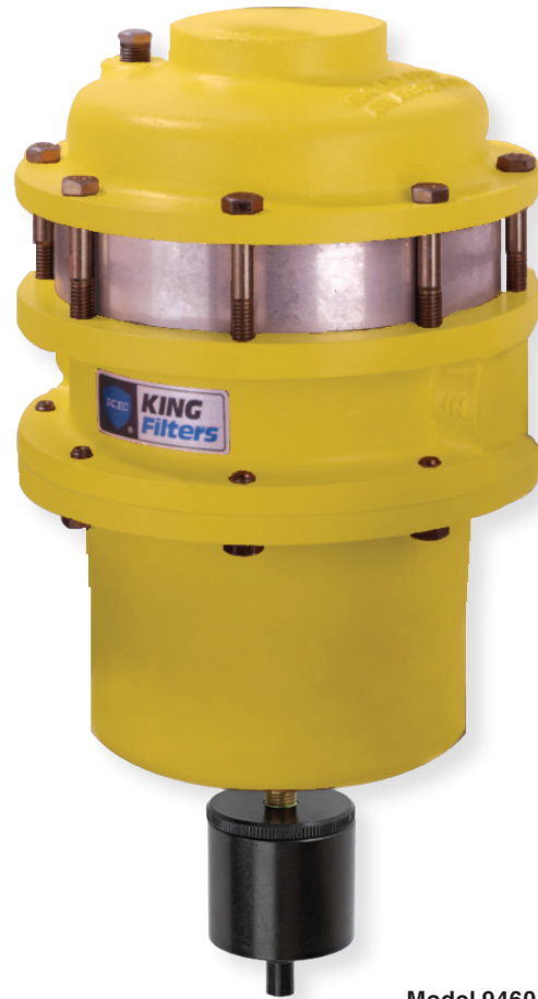
Model 9460 Air-Guard Compressed Air Filter

The second stage polisher cartridge encompasses media that remove the last remaining harmful traces of oil, water and dirt to deliver exceptionally clean air at the outlet of the filter.