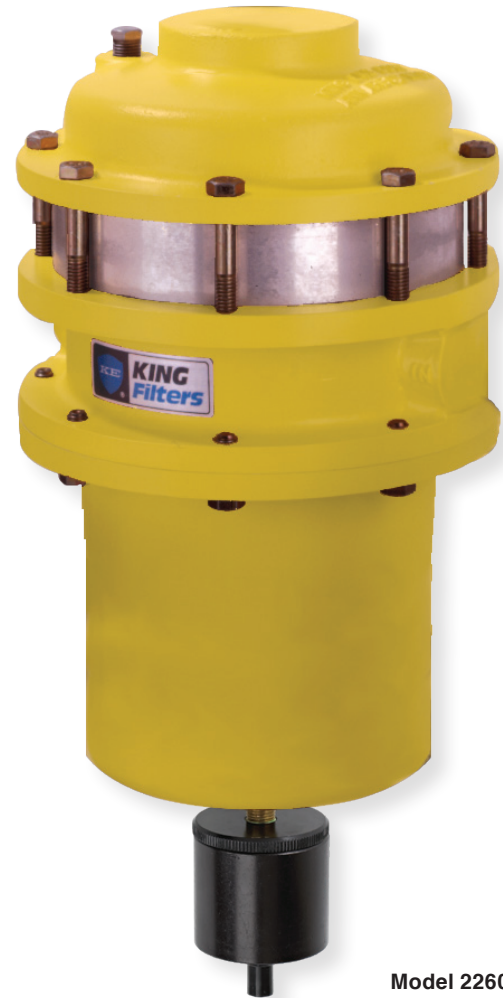
Model 2260 Air-Guard Compressed Air Filter

The second stage polisher cartridge encompasses media that remove the last remaining harmful traces of oil, water and dirt to deliver exceptionally clean air at the outlet of the filter.