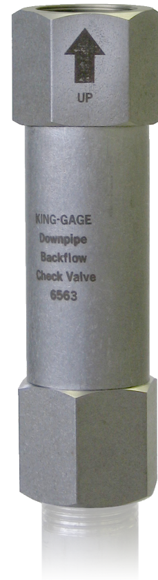
Model 6563 Check Valve

Of course, proper placement and installation is important for reliable operation of the Downpipe Check Valve. It is recommended that you install the check valve in an upright position on a vertical portion of the downpipe so that the float will move freely. Do not position the check valve along any horizontal run of the downpipe as it will fail to operate as intended.