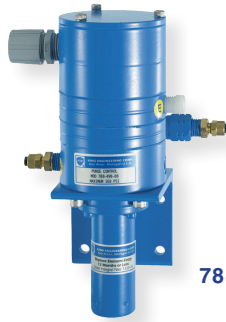
788 D/P Purge Control